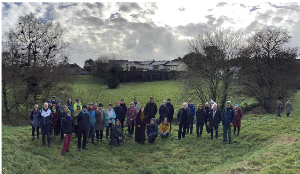
This second photograph shows the area immediately north of the wells (the dip where Duchas stories say the monastery was originally located)