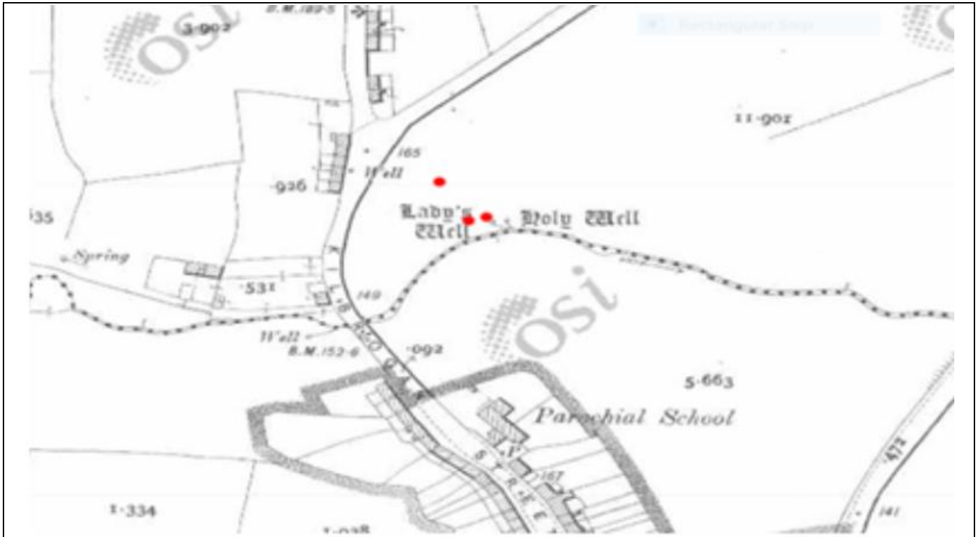
Ordnance Survey Map of Kilbrogan 1846 National Monuments service records shown in red

That the “organisation of the Irish Church differed so substantially from the normal episcopal hierarchy of the Western Church” has baffled academics and researchers for many centuries (Sources recited post note). The Roman model took root without difficulty elsewhere. In contrast, the C9th Skellig (ascetic) model founded e.g in Kildare, Derry, Kells etc, flowered in Ireland and the Northern Provinces of Lindisfarne and Iona.