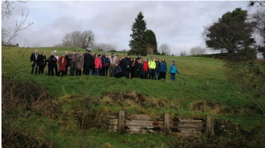
The field group stopped at this spot, directly above the still-visible Holy Wells.

There once was a passageway between the wells, which thankfully the Football Club have preserved by installing supporting beams.